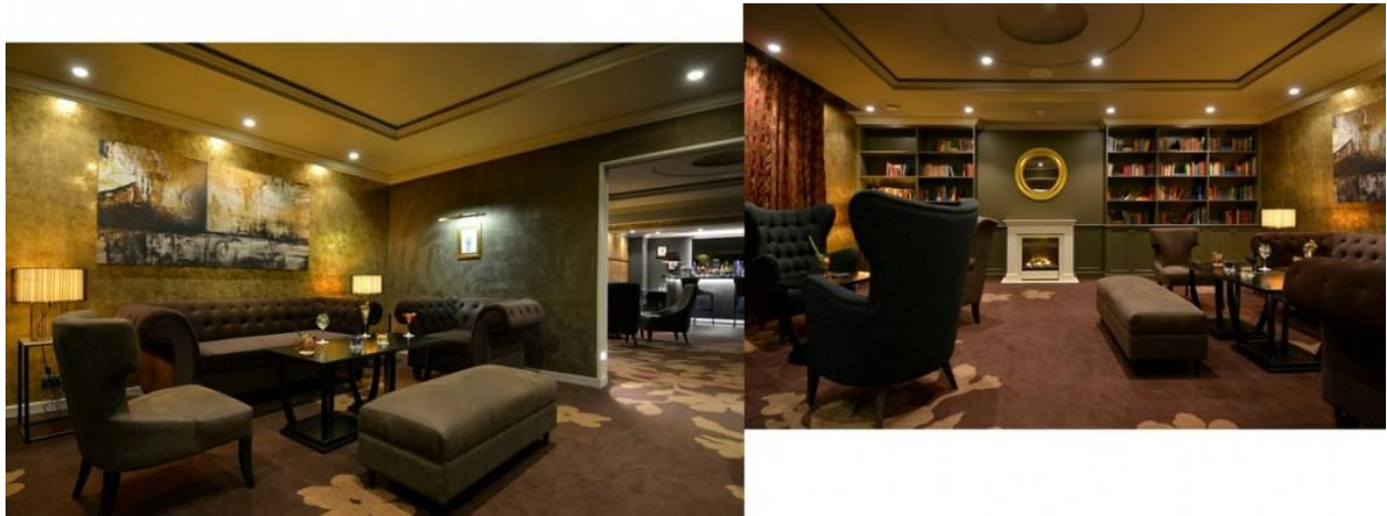
Hyatt Centric La Rosiere